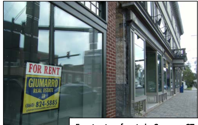
Empty storefronts in Canaan, CT

Our historic small town village centers are vital to the way we live and work in the Northwest Corner. The current recession has seriously impacted the economic stability of our village centers. Many storefronts sit vacant and existing businesses struggle to survive.