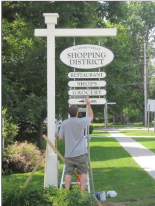
New Salisbury signage being installed

Part of our NWCT Village Center Signage & Wayfinding Initiative