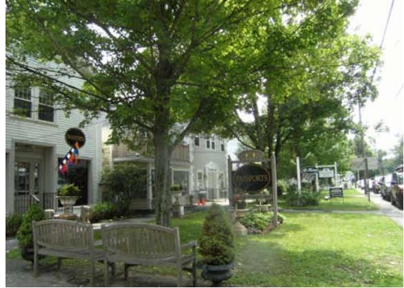
Salisbury, CT village center